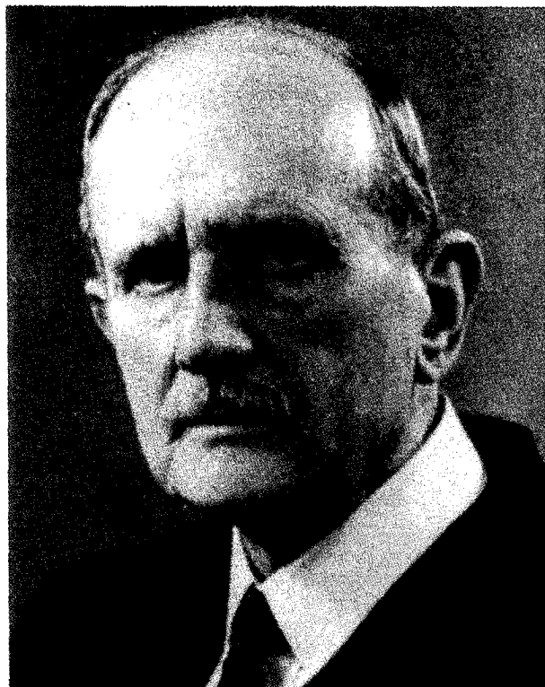
Brigadier-General Sir James Edmonds, Official British Historian of the First World War