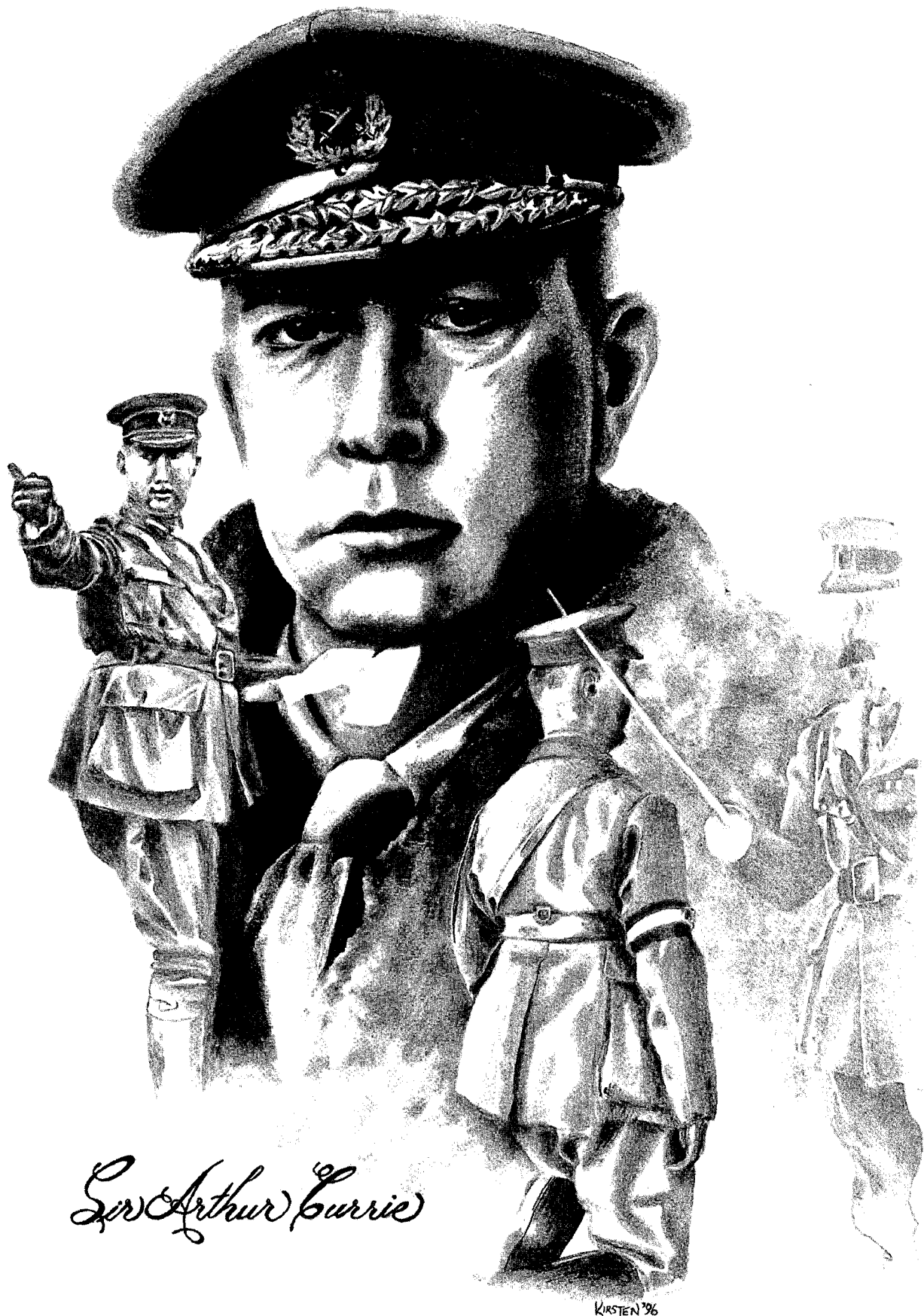
Sir Arthur Currie