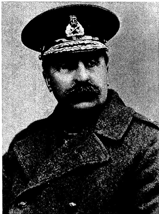
Lieutenant-General Sir E.A.H. Alderson, General Officer Commanding 1st Canadian Division.